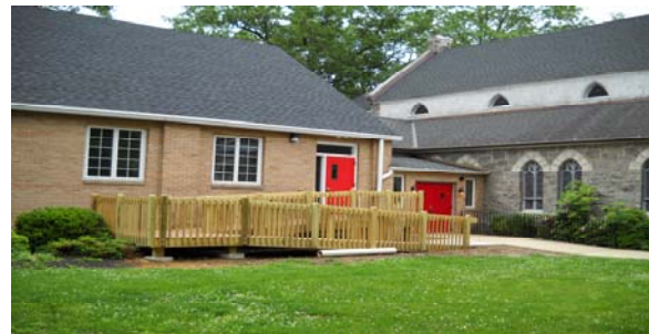
Our New Handicap Ramp